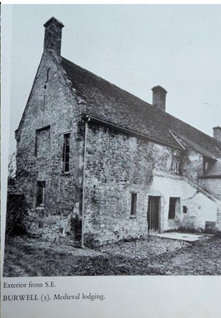
Exterior from S.E. BURWELL (s). Medieval lodging.